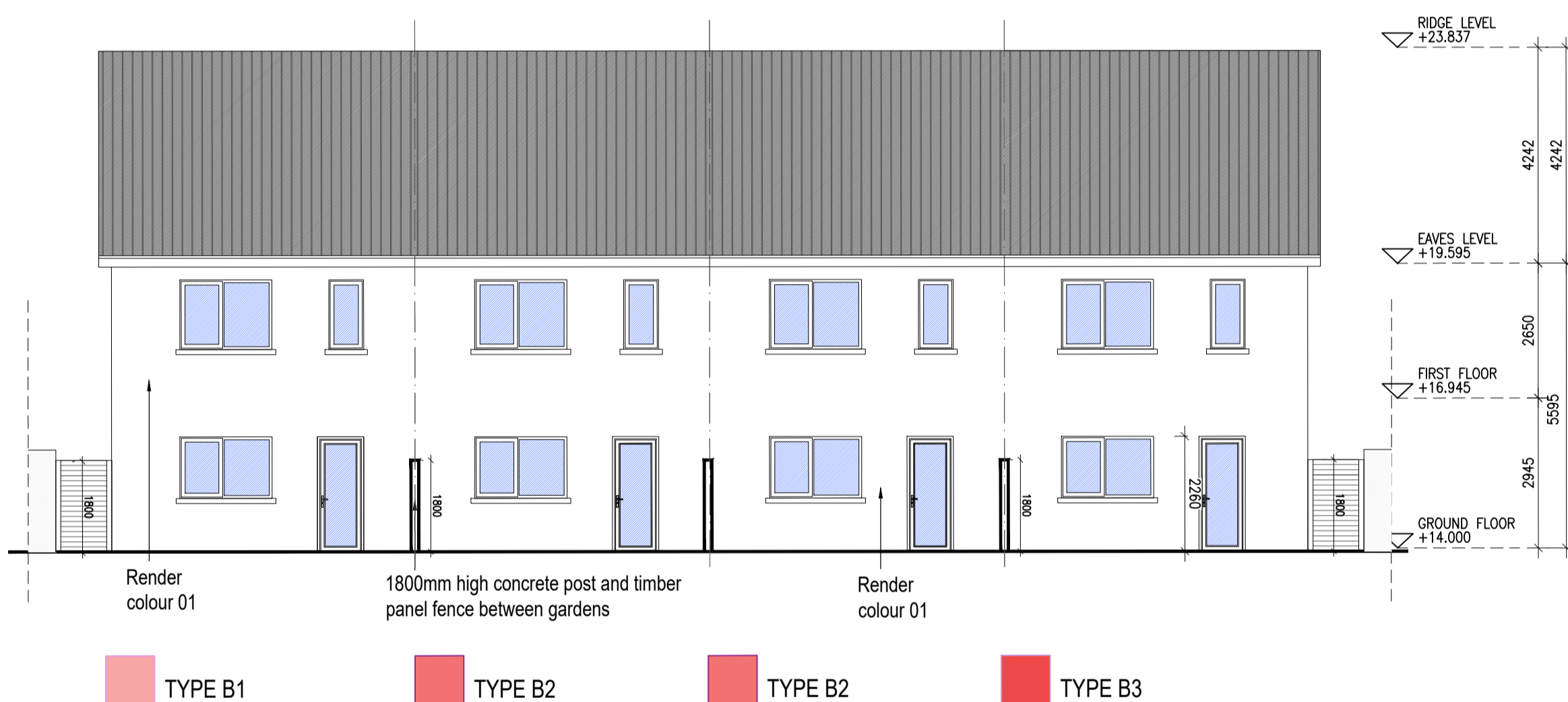
04 61 1:100@A1 3 BED HOUSE Type B1, B2, B3 - Rear Elevations - Skylark