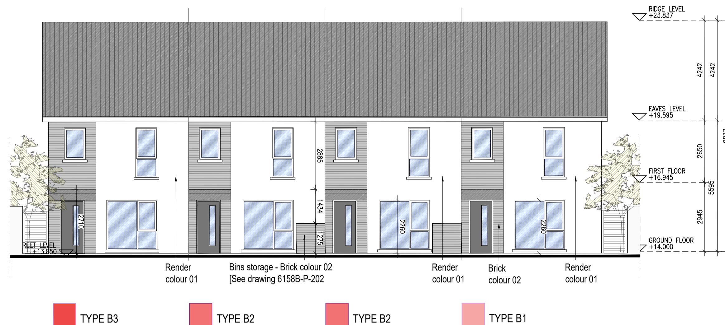
01 61 1:100@A1 3 BED HOUSE Type B1, B2, B3 - Front Elevations - Skylark